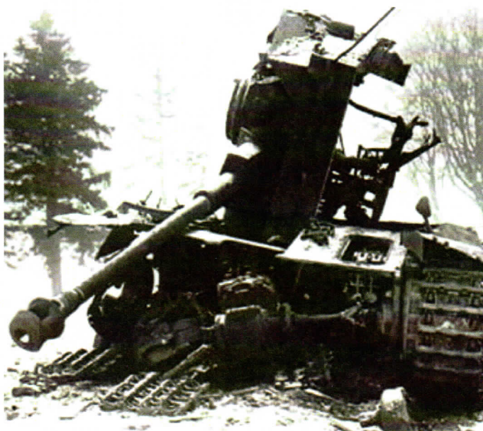
The Battle of the Bulge, 1944-45: a shattered German tank, its turret blown off by anti-tank fire.