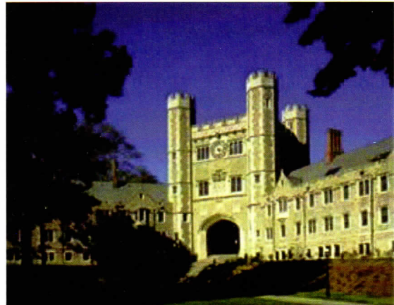
Princeton University, New Jersey